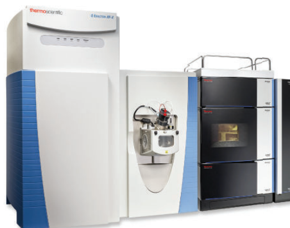
Q Exactive HF-X mass spectrometer with H-ESI II ion source and Thermo Scientific™ Vanquish™ UHPLC System