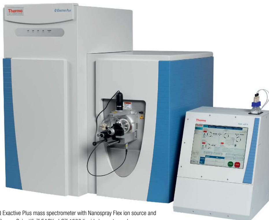
Q Exactive Plus mass spectrometer with Nanospray Flex ion source and Thermo Scientific™ EASY-nLC™ 1000 liquid chromatograph